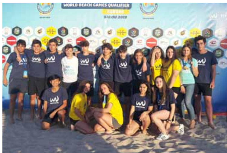
More than 50 ESO/BAT/IB students volunteered at the World Beach Soccer Tournament

We are already planning for the next school year and the school will continue to grow. Some classes have spaces, others have waiting lists. We have invested time in preparing for development and improvement in a number of key aspects as you would expect. This includes generally providing information and communicating as far in advance as is realistic in order to help you with your own organisation. Please keep an eye on emails between now and September so that you are ready for the 2019-20 School Year, and don't forget